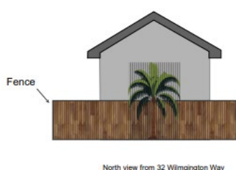
Fig 3: the large, two-storey grey wall 32 Wilmington Way would look onto.

The residents at 32 and 30 Wilmington Way would have their views destroyed by a large two-storey grey wall replacing their current open view of the sky.