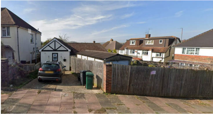
Fig. 4: the current ample space and open character between 27 Mayfield Crescent and 32 Wilmington Way.