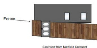
Fig.2: the proposal would be out of keeping with the character of the neighbourhood.

The residents at 32 and 30 Wilmington Way would have their views destroyed by a large two-storey grey wall replacing their current open view of the sky.